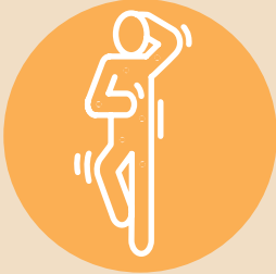
STINGING OR TINGLING SKIN

A The most common reaction is that the scabies itch can get worse. Some people may experience a stinging, tingling or burning feeling of the skin or their skin may become red, but this is very rare.