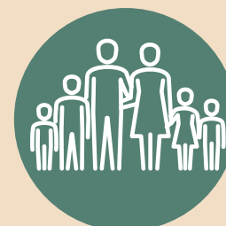
TREAT YOUR MOB

Take treatment (tablet or cream) to get rid of scabies.